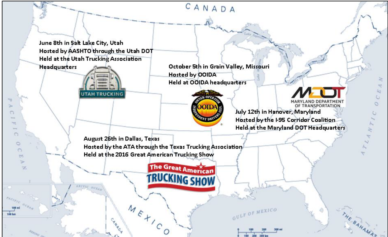
Figure 6. Map. Locations of the 2016 regional meetings.