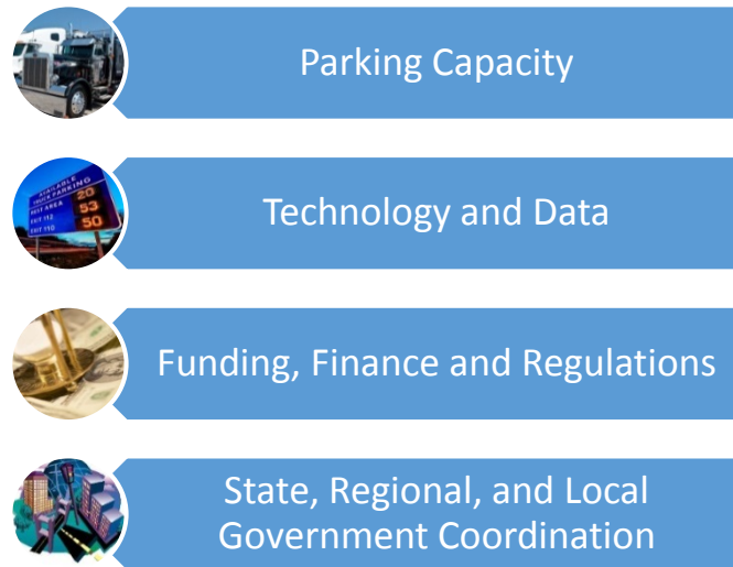
Figure 2. Diagram. Topic areas addressed at the regional meetings.

At the regional meetings, participants shared their ideas on the following four discussion areas, which were identified during the November, 2015 Coalition kick-off meeting: